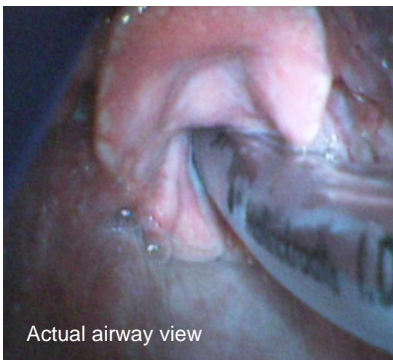
Actual airway view

Whether it’s in the ED, the OR, or the ICU, patients present in all shapes and sizes – it’s important to choose an airway device that’s right for them. The GlideScope® GVL®.